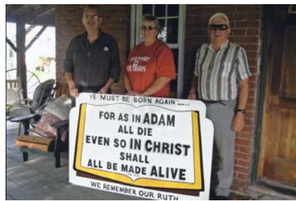
New Liskeard, ON