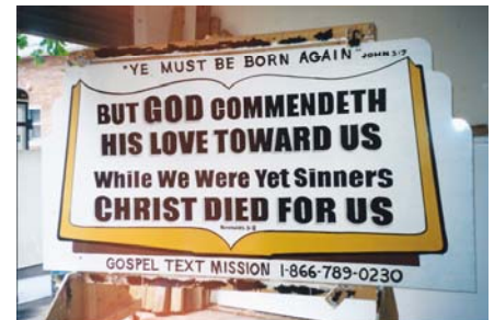
Garlow Baptist Church, Hagersville, ON