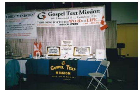
Winnipeg, MB Missionfest – 2012

THANK YOU FOR YOUR CONTINUED PRAYER and FINANCIAL SUPPORT