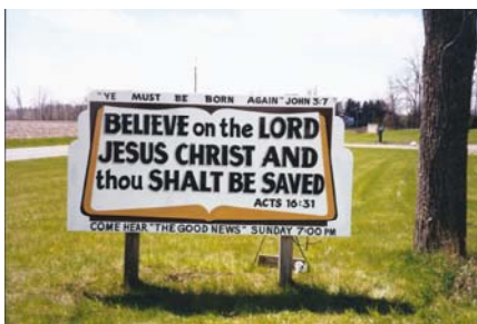
Newberry G.H. – Thamesville, ON