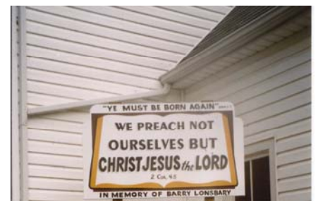
Tilbury Baptist Church – Tilbury, ON